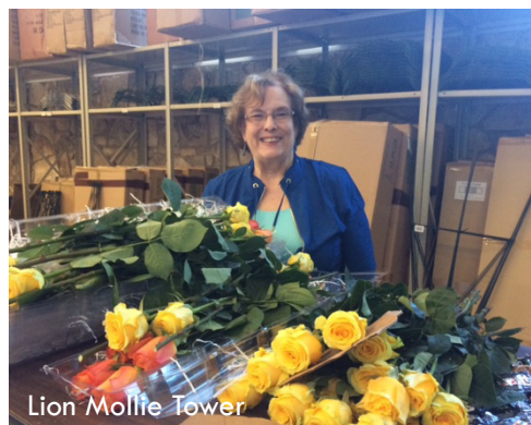
Lion Mollie Tower