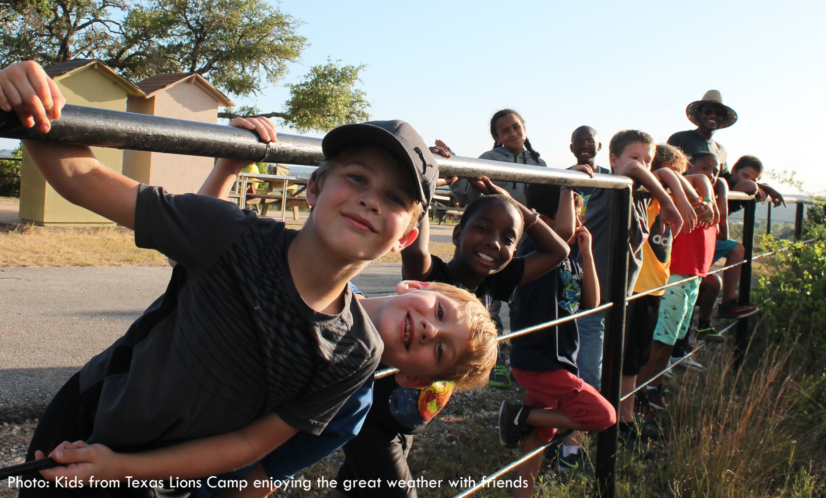
Photo: Kids from Texas Lions Camp enjoying the great weather with friends