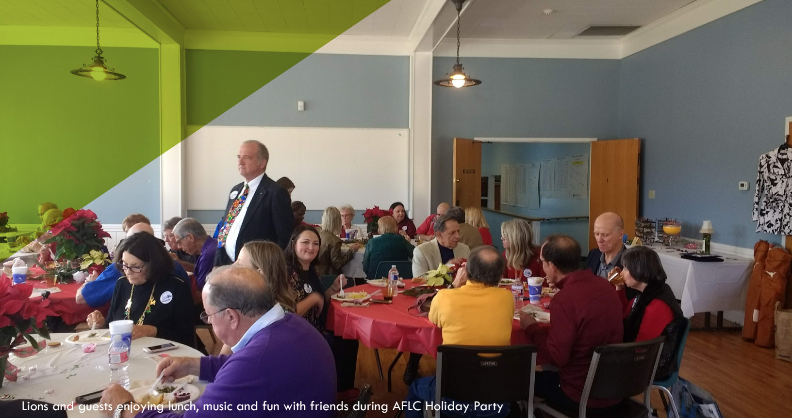
Lions and guests enjoying lunch, music and fun with friends during AFLC Holiday Party